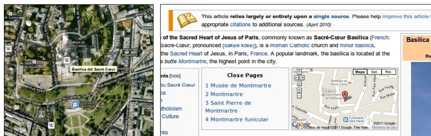
Fig. 1. Inter-application CSN between Google Maps and Wikipedia

Figure 1 shows an example of concern-sensitive navigation across two applications: Google Maps (as the source of navigation) and Wikipedia (as the target). The left-side of Figure 1 displays Wikipedia links in the map of Paris; once selected, these links trigger the exhibition at the right-side of Figure 1 the corresponding map and a set of links to those Wikipedia articles in the surroundings of the current one.