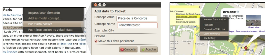
Fig. 2.a. Information collection from Wikipedia using a DataCollector

Two types of DataCollectors have been implemented: Untyped Pocket which implements a copy & paste behaviour for simple text (e.g. “Paris”); and Typed Pocket which allows users to label data (e.g. “Paris” is “City”). In both cases, selected information is placed into a temporary memory called Pocket . Data collection is supported via the contextual menu options “put it into pocket” (i.e. Typed Pocket ) and “put it into volatile pocket” (i.e. Untyped Pocket ). Figure 2.a illustrates the collection of a piece of information (i.e. “Place de la Concorde”) using the option “put it into pocket” which has been labelled “PointOfInterest”. Collected information become available into the Pocket as shown by Figure 2.b (yellow box at the upper-left side).