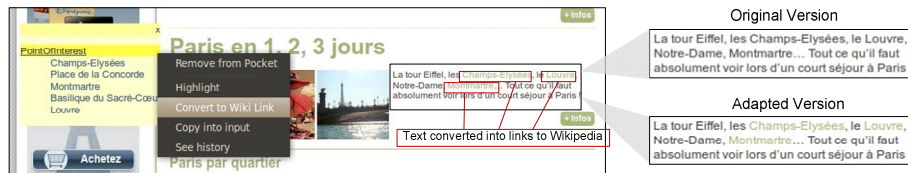
Fig. 4. Text plain converted into link to add personal navigation

corresponding page associate to the information PointOfInterest . The augments Highlight works in a similar way but it changes the colour of the text instead of created links. Due to space reasons, the augments Highlight is not illustrated here.