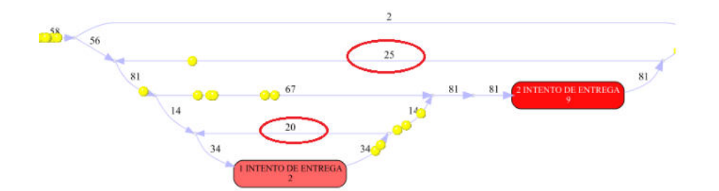
Fig. 5. Traces that do not comply with the model, in a circle the amount that goes backwards from a state instead of going forward (see direction of the arrow)

as well as cases that did follow it but outside the expected times or with task redundancy. Further analysis is required to determine if these cases represent manual load errors, and to look for a solution.