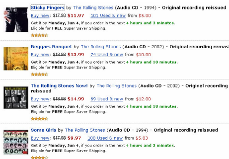
Figure 2. An enriched version of the index in Figure 1

In this paper we characterize model refactoring in Web applications and present a set of concrete refactorings to illustrate our ideas. Particularly, our research is aimed at: