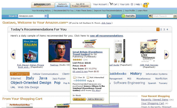
Figure 5. Recommendation List after Enrich Index

Impact: Enrich Index is composed of refactorings at both the navigation and the presentation levels. Moreover, it shows that we can compose refactorings in different ways: a conjunctive composition, where all refactorings are applied in a particular order, or a disjunctive composition, where we can apply refactorings alternatively.