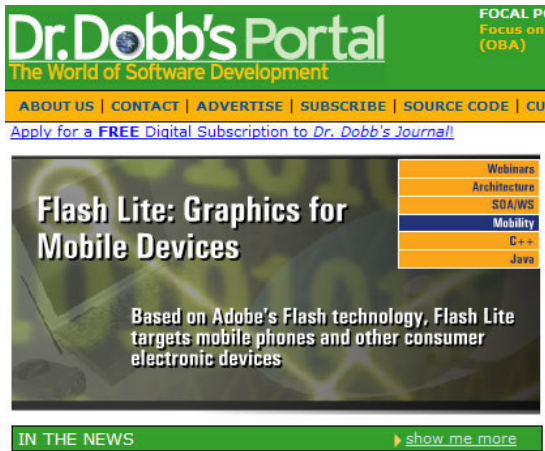
Figure 3. Showing different targets in the same area.

Impact: Notice that this refactoring has two alternative mechanics, one at the presentation level, and the second at the navigation level. Applying the second solution, i.e., Add Target Information, on the navigation model will trigger other refactorings at the presentation layer to reflect the transformation.