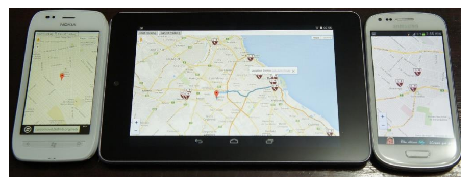
Fig. 4. Sample Geolocation Web Application using Javascript and HTML5

Figure 4 shows the mobile web application running in different mobile devices with different operating systems.