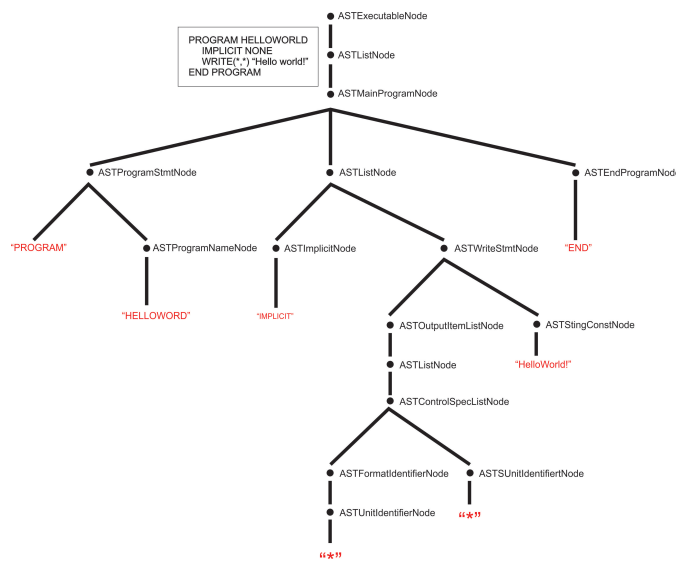
Fig. 1. A Complete AST Structure for a helloworld.f90 Program

Photran infrastructure uses a compiler-like approach to represent a Fortran program by building an Abstract Syntax Tree (AST) as a program representation. An AST “represents the hierarchical syntactic structure of the source program.” [1]. Each construct occurring in the source code of the program is denoted on a tree node. It is called “abstract” because the AST does not represent every detail which appears in the real syntax, see Figure 1. The Photran AST