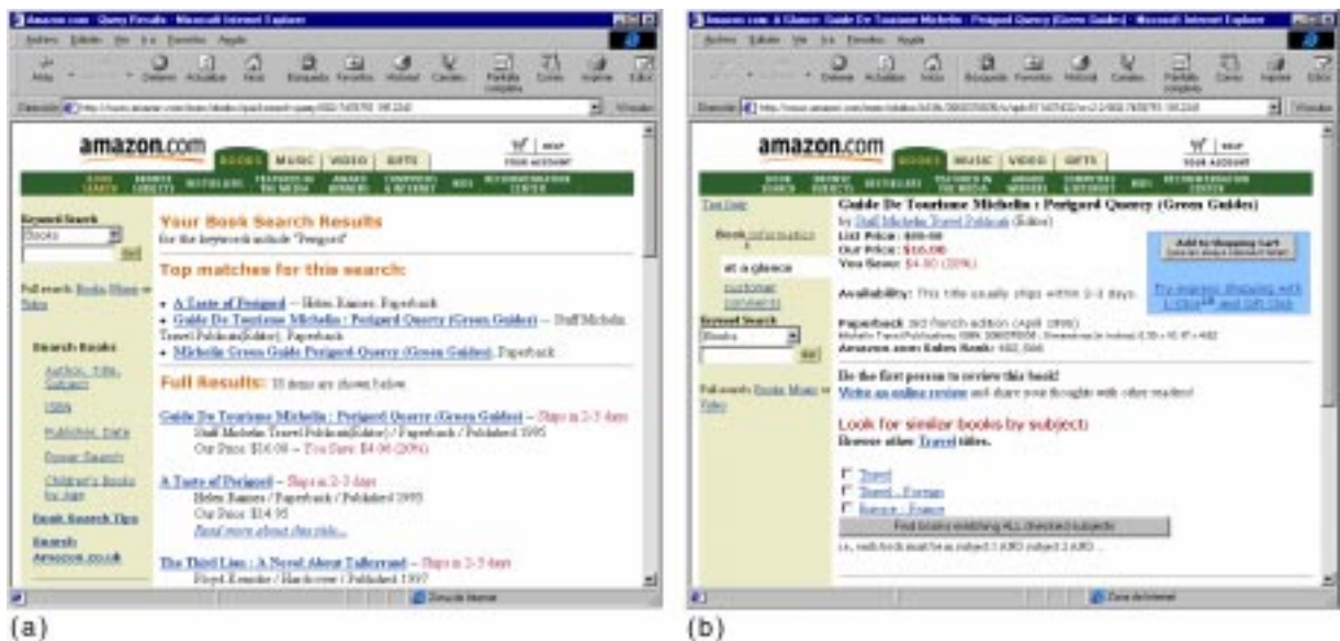
Fig. 2. (a) A set index in Amazon. (b) A set member.

is not improved with intra-set navigation operations. In Fig. 2a we show the result of a search and in Fig. 2b one of the members of that set. The problems of backtracking to the index to navigate to another member of a set are well-known, as we have to scroll to the last navigated index element before proceeding to the next result.