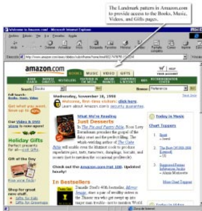
Fig. 5. Landmarks in Amazon.

sub-system is highlighted. Landmarks generalize the idea of Home page in early Web-sites by enriching it as new requirements emerge in complex applications like electronic commerce. In Fig. 5 we show how landmarks are used in Amazon.