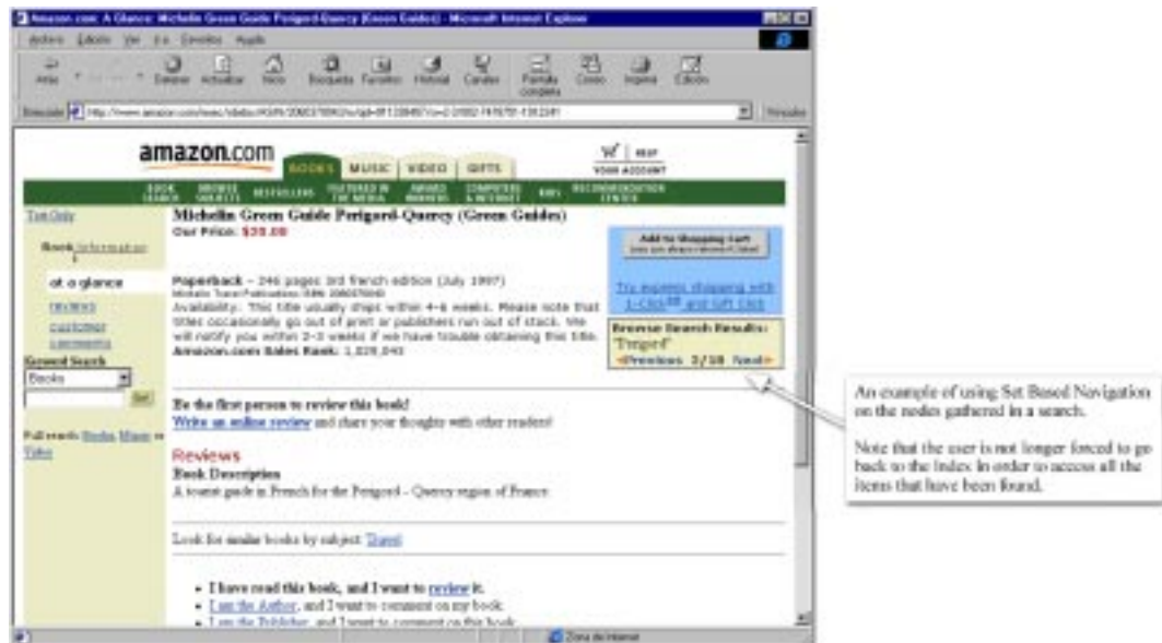
Fig. 3. Improving 'Set-Based Navigation' in Amazon.

We could solve this problem either by treating the index as an Active Reference [13], thereby allowing the set index to co-exist with set members on the desktop, or to improve navigation in the set as we show in Fig. 3. It should be observed that the two added buttons must have their destination assigned dynamically, according to the set we are traversing.