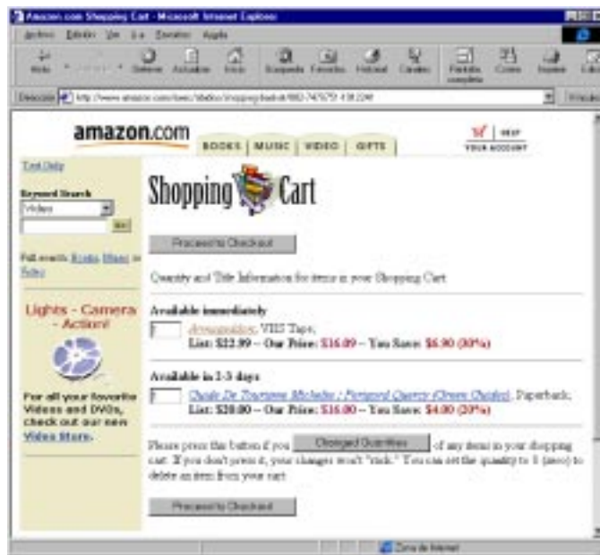
Fig. 6. Shopping basket in Amazon.

single ‘branch’ or ‘category’. As a result of this, the upgraded Web-site may present the following problems: