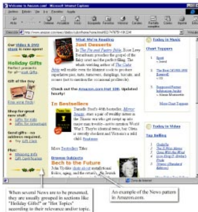
Fig. 4. News in Amazon.

Landmarks are critical in this kind of WIS because they simplify the user's task while navigating. In Amazon there are many Landmarks providing access to the three different stores (books, CDs, gifts), to the user's shopping basket and to the user's account. The interface is kept uniform and the current